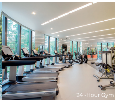
24 -Hour Gym