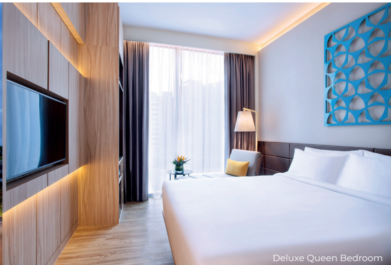
Deluxe Queen Bedroom