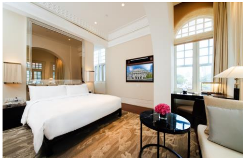
Deluxe Room: $325++

Located in Singapore's charming civic and cultural district, the conserved Capitol Building and Stamford House have been restored to unveil as The Capitol Kempinski Hotel Singapore. This timeless yet contemporary hotel features 155 guestrooms and suites, an exclusive event space, as well as a collection of dining concepts at Arcade @ The Capitol Kempinski