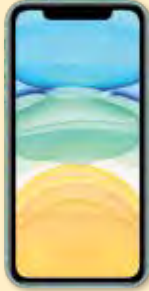
iPhone 11 256GB Upfront Cost $419

mySIM*70 | EM12+ $45.50/mth | $53.10/mth