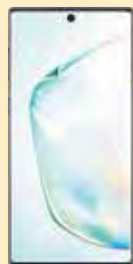
Samsung Galaxy Note 10 Upfront Cost $379

mySIM*70 | EM12+ $45.50/mth | $53.10/mth