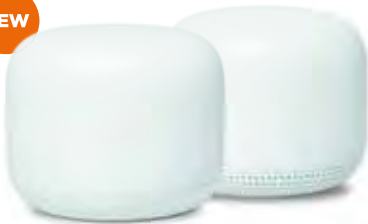
Google Nest Wifi (Router and point worth $428) $15/mth