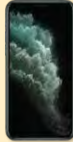
iPhone 11 Pro 256GB Upfront Cost $849

mySIM*70 | EM12+ $45.50/mth | $53.10/mth