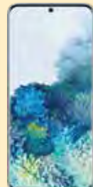
Samsung Galaxy S20 Upfront Cost $419

mySIM*70 | EM12+ $45.50/mth | $53.10/mth