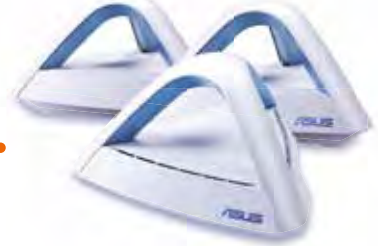
ASUS Lyra Trio (Pack of 3 worth $459) $10/mth