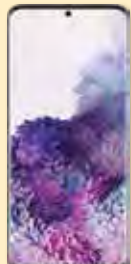
Samsung Galaxy S20+ Upfront Cost $519

mySIM*70 | EM12+ $45.50/mth | $53.10/mth