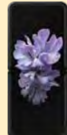
Samsung Galaxy Z Flip Upfront Cost $889

mySIM*70 | EM12+ $45.50/mth | $53.10/mth