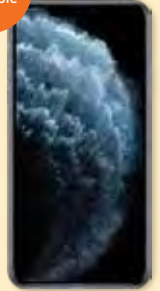
iPhone 11 Pro Max 256GB Upfront Cost $969

mySIM*70 | EM12+ $45.50/mth | $53.10/mth