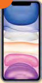
iPhone 11 128GB Upfront Cost $279

mySIM*70 | EM12+ $45.50/mth | $53.10/mth