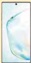
Samsung Galaxy Note 10+ Upfront Cost $479

Available at all M1 Shops and M1 Exclusive Distributors Promo ends 31 March, 2020 | During shop opening hours