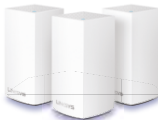
Linksys Velop (Pack of 3 worth $399) $10/mth