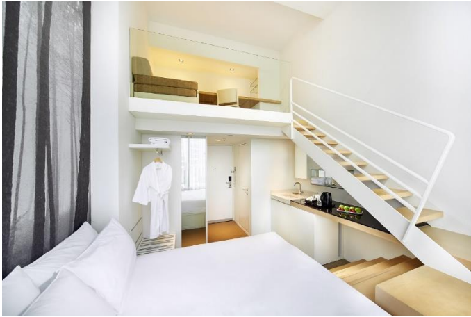
STUDIO LOFT S$168++ (S$197.74Nett) per room night